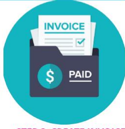
STEP 2: CREATE INVOICE IN MEDTECH