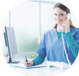
STEP 1: PROVIDE CONSULTATION